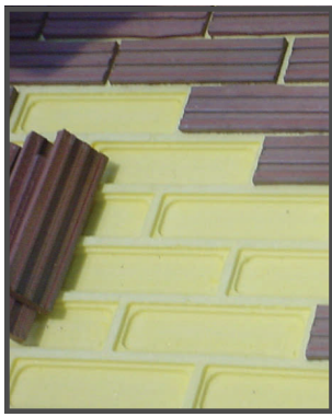
Thin bricks are shown placed in a form liner.

Architect Burgess & Niple Architects, Parkersburg, WV Contractor Carl Walker Construction, Parkersburg, WV Owner Morgantown Parking Authority, WV